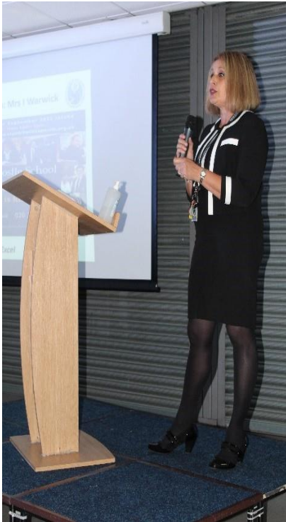
St Andrew the Apostle School- Highlights of our Open evening Thursday 16 September 2021